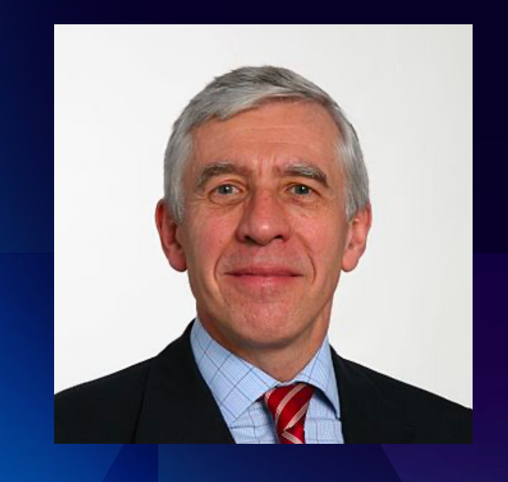
Jack Straw Former UK Prime Minister Tony Blair Minister of the Interior and Minister of Foreign Affairs