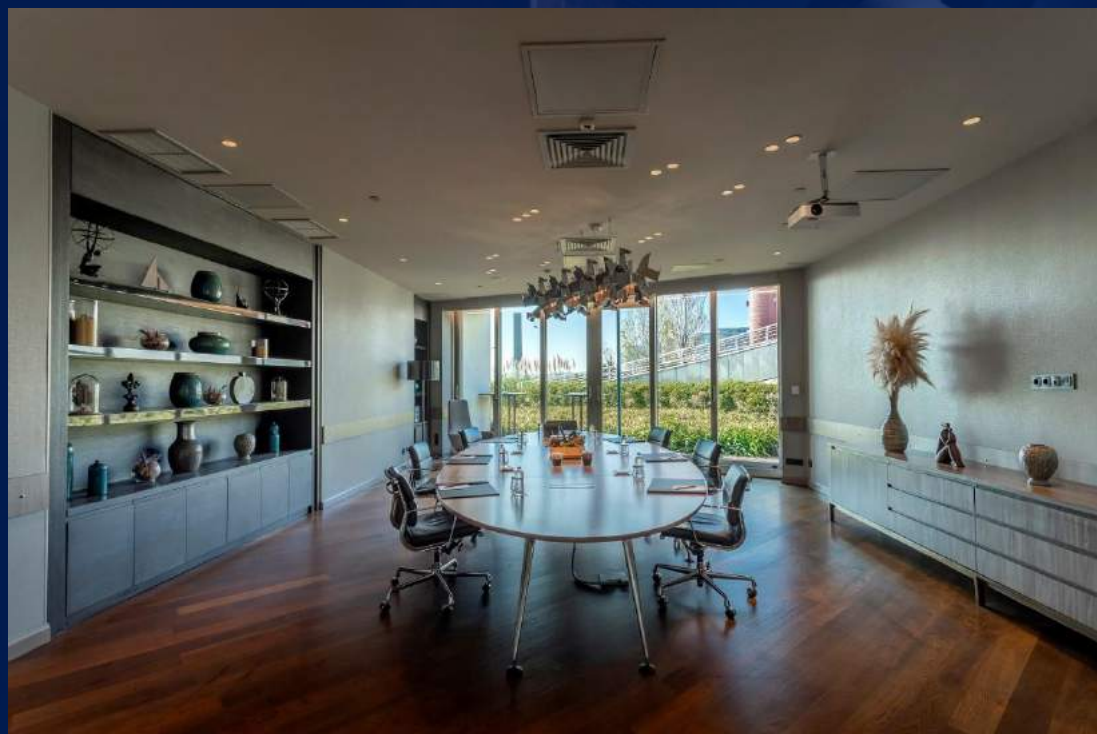
PDR (Private Dining Room)