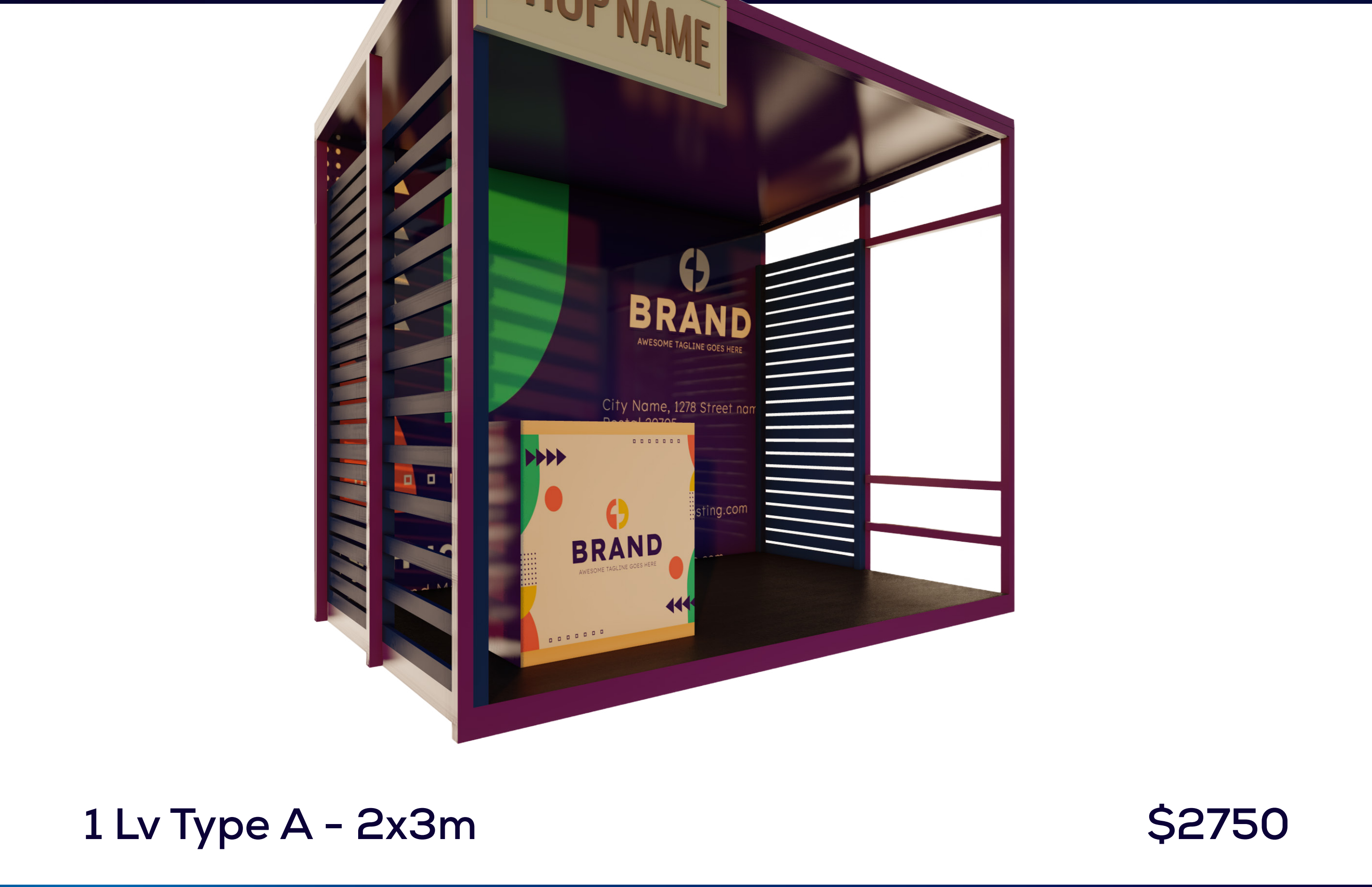
1 Lv Type A - 2x3m