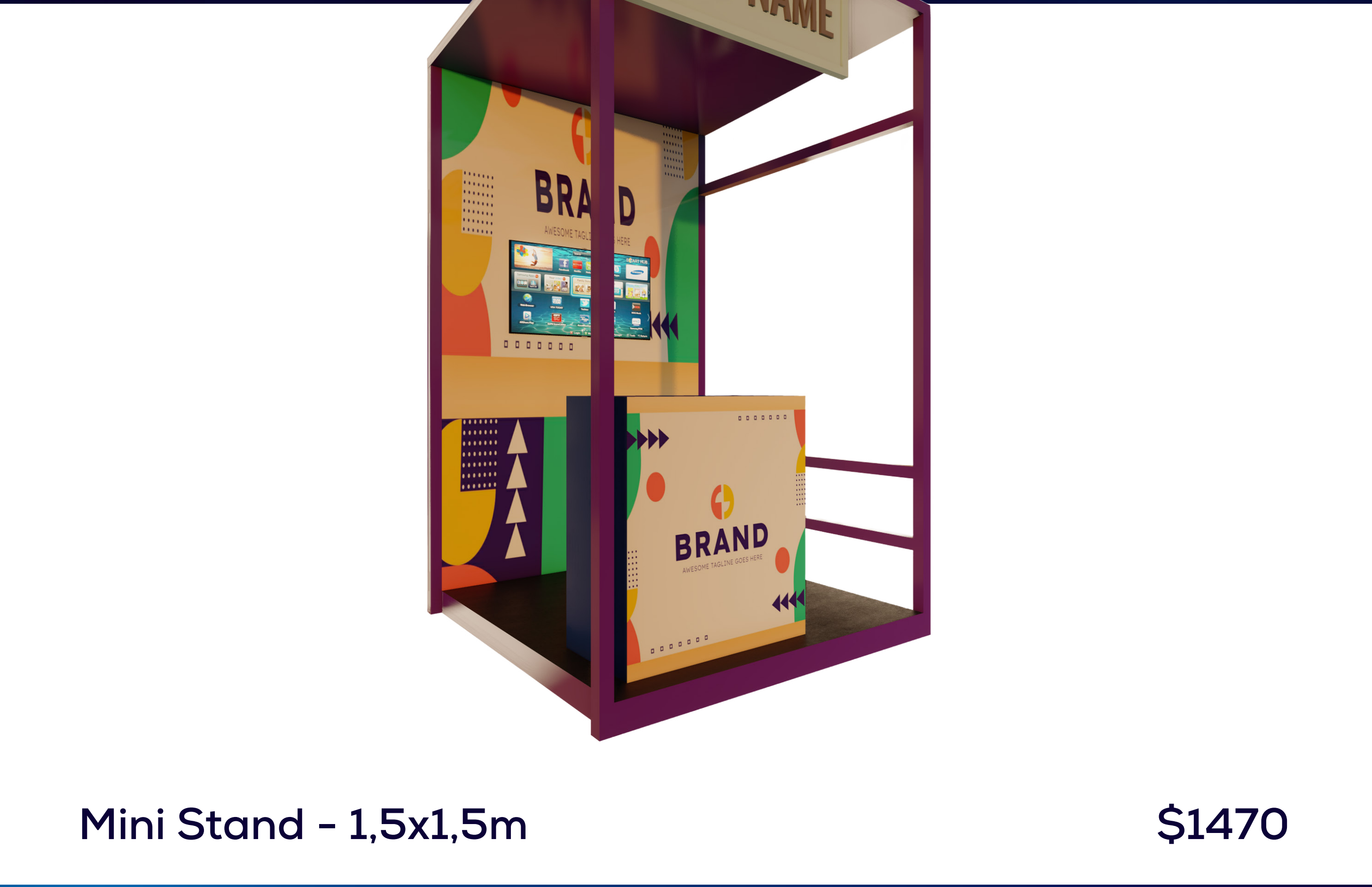
Mini Stand - 1,5x1,5m