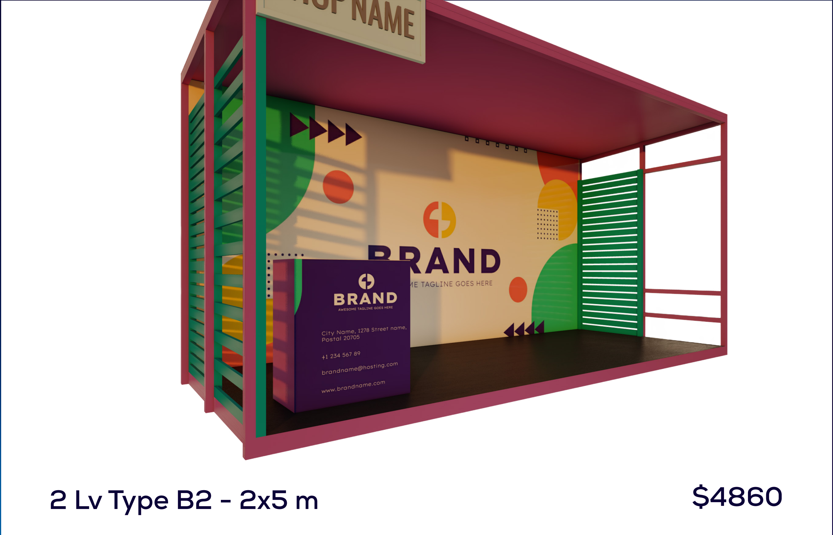
2 Lv Type B2 - 2x5 m