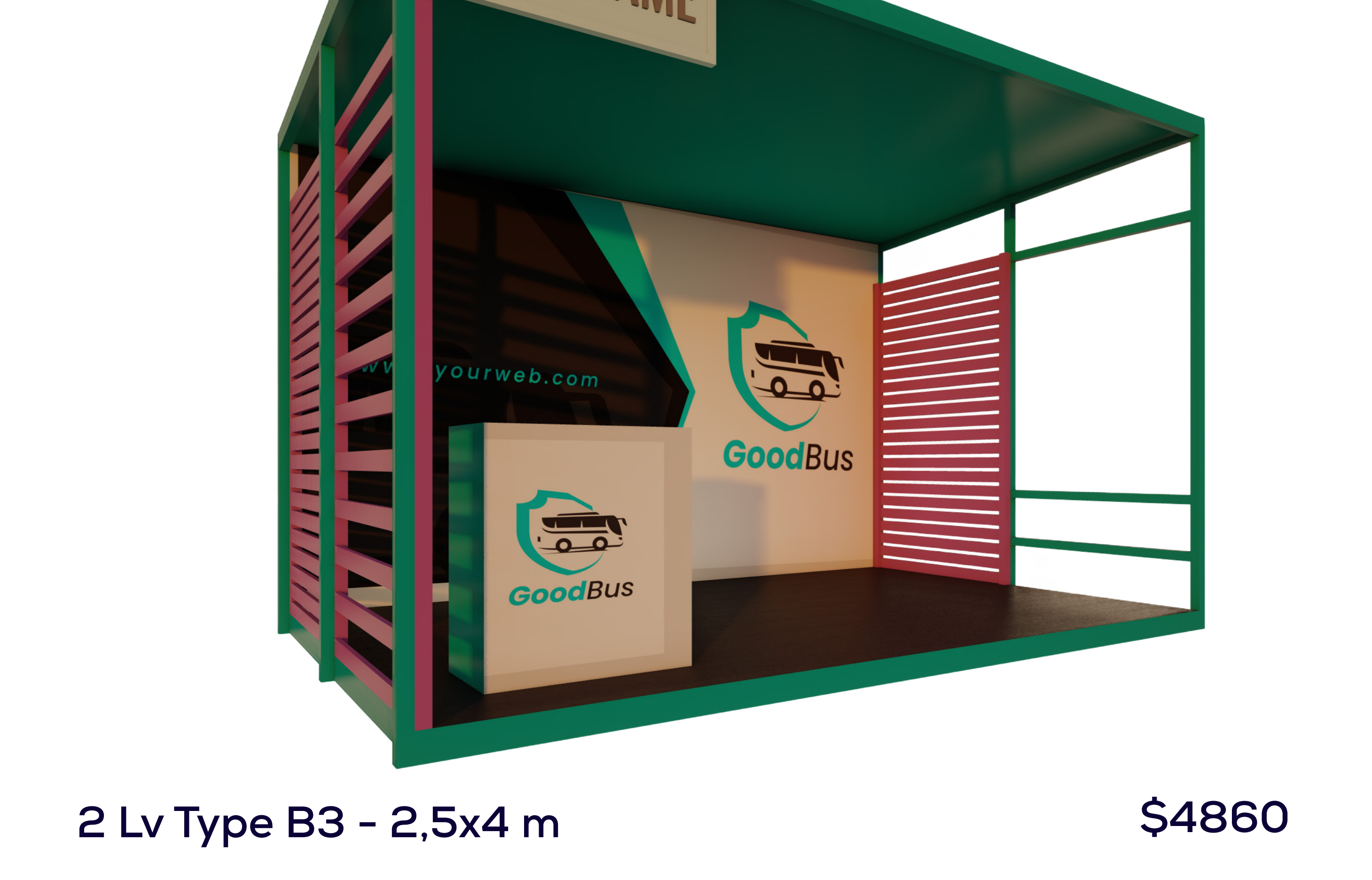
2 Lv Type B3 - 2,5x4 m